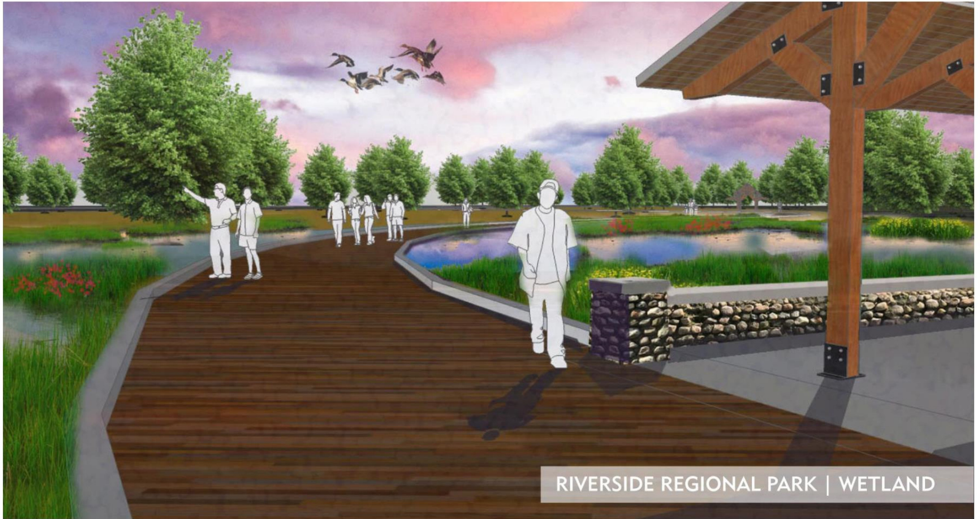
RIVERSIDE REGIONAL PARK | WETLAND