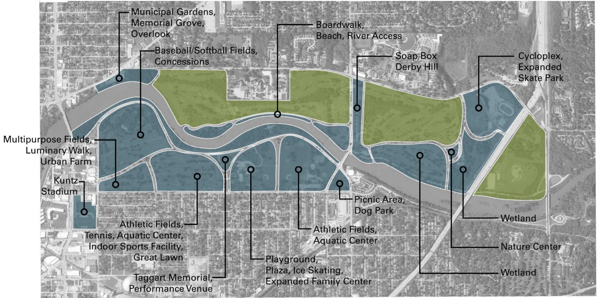
Land Use - Potential Programming Locations