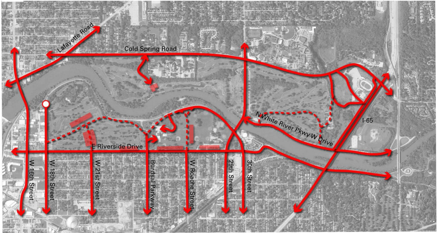
Vehicular Circulation - Proposed