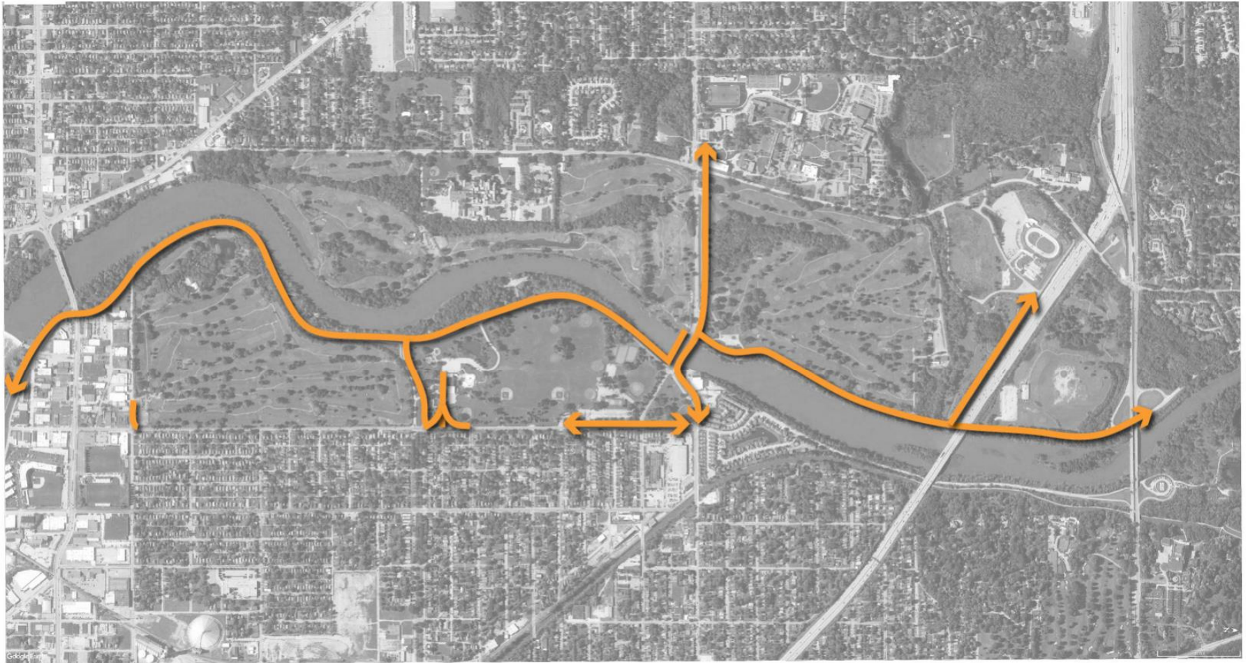
Pedestrian Circulation - Existing