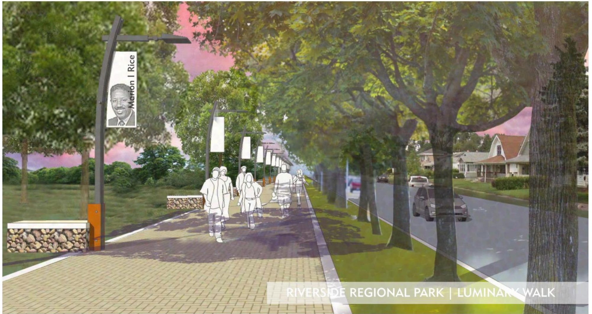
RIVERSIDE REGIONAL PARK | LUMINARY WALK