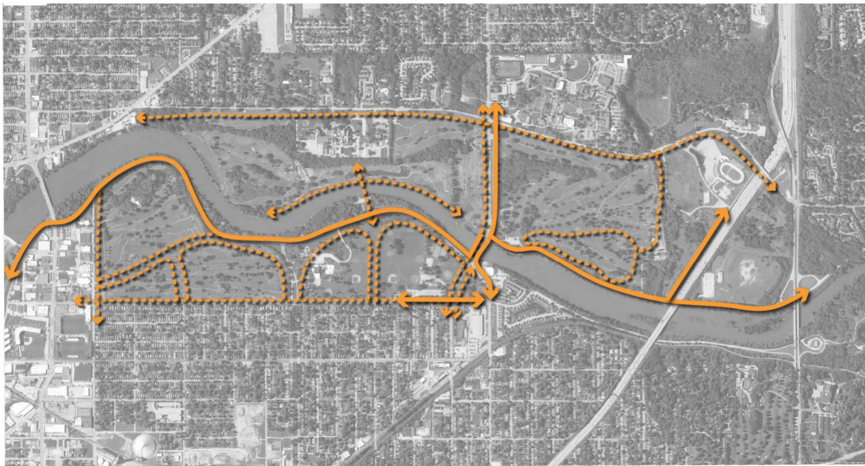
Pedestrian Circulation - Proposed