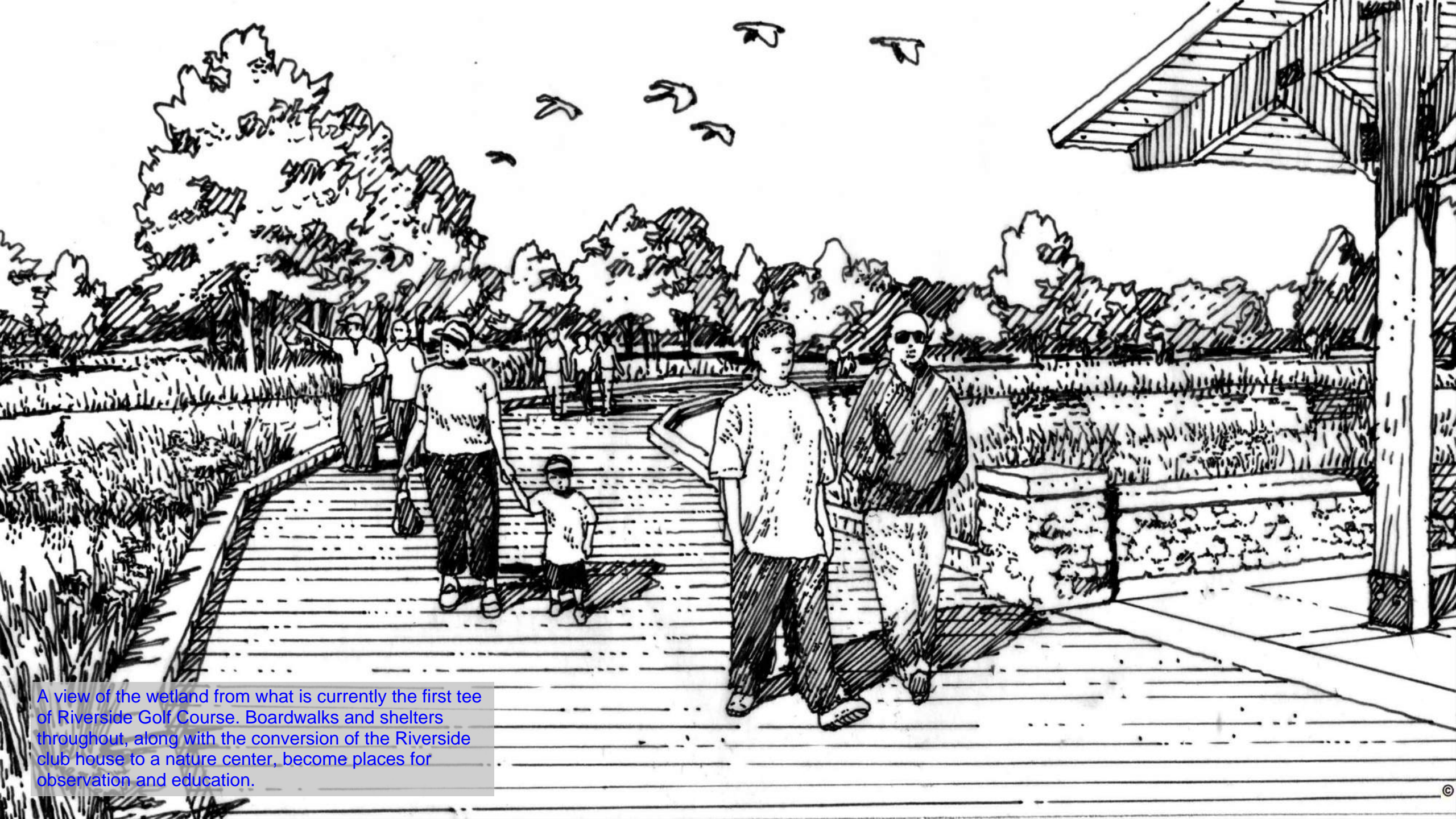
A view of the wetland from what is currently the first tee of Riverside Golf Course. Boardwalks and shelters throughout, along with the conversion of the Riverside club house to a nature center, become places for observation and education.