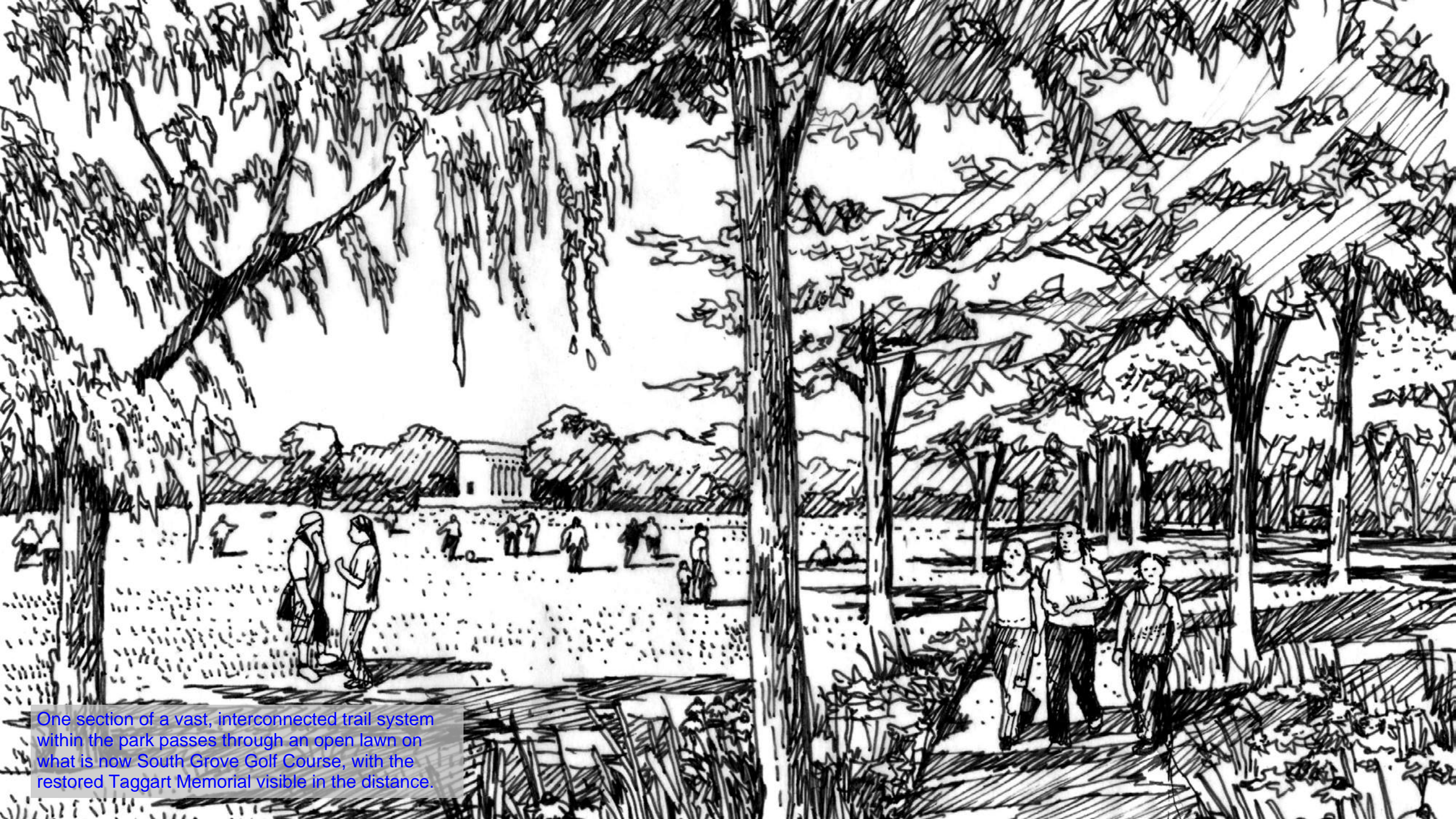
One section of a vast, interconnected trail system within the park passes through an open lawn on what is now South Grove Golf Course, with the restored Taggart Memorial visible in the distance.