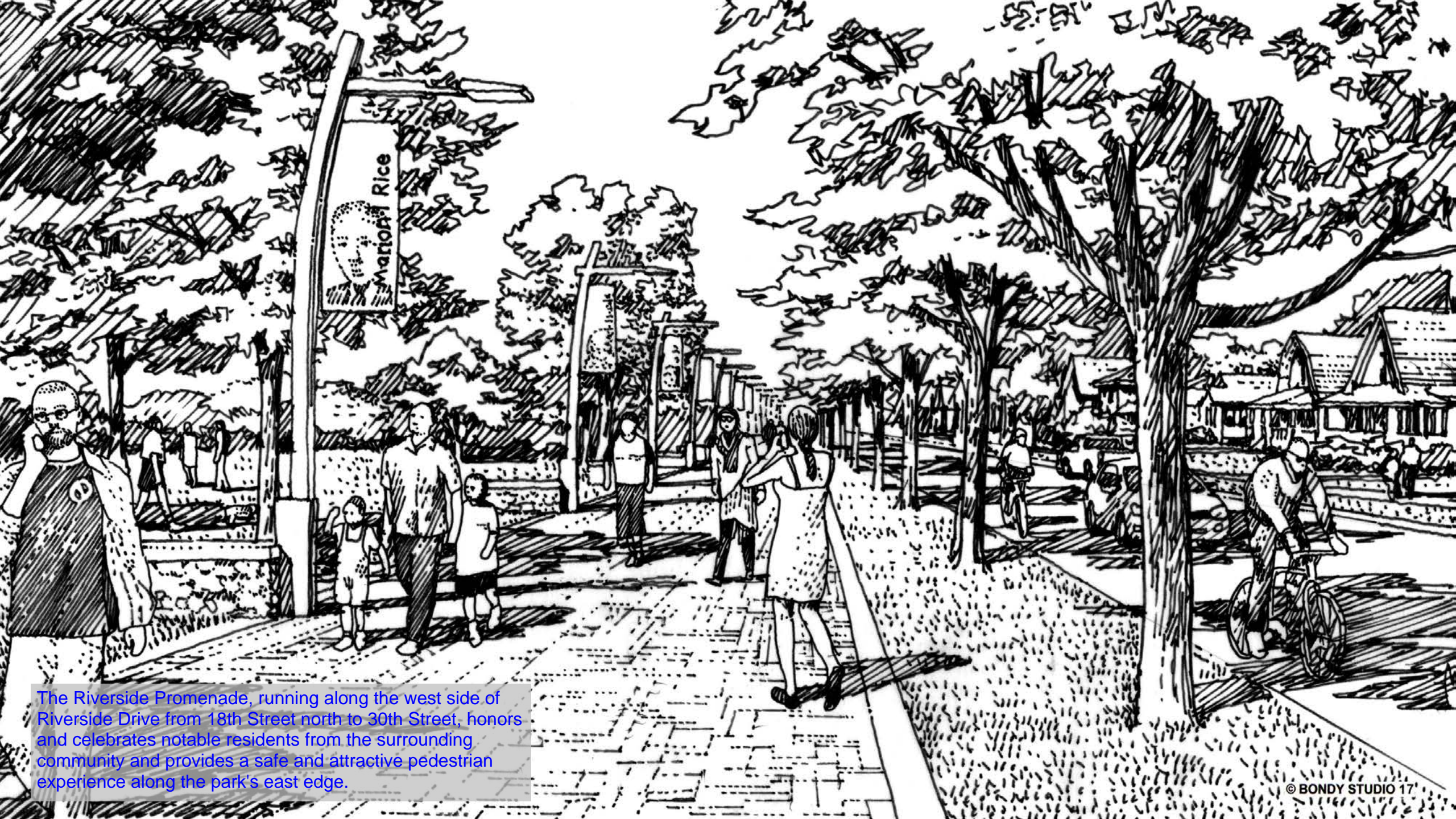
The Riverside Promenade, running along the west side of Riverside Drive from 18th Street north to 30th Street, honors and celebrates notable residents from the surrounding community and provides a safe and attractive pedestrian experience along the park's east edge.