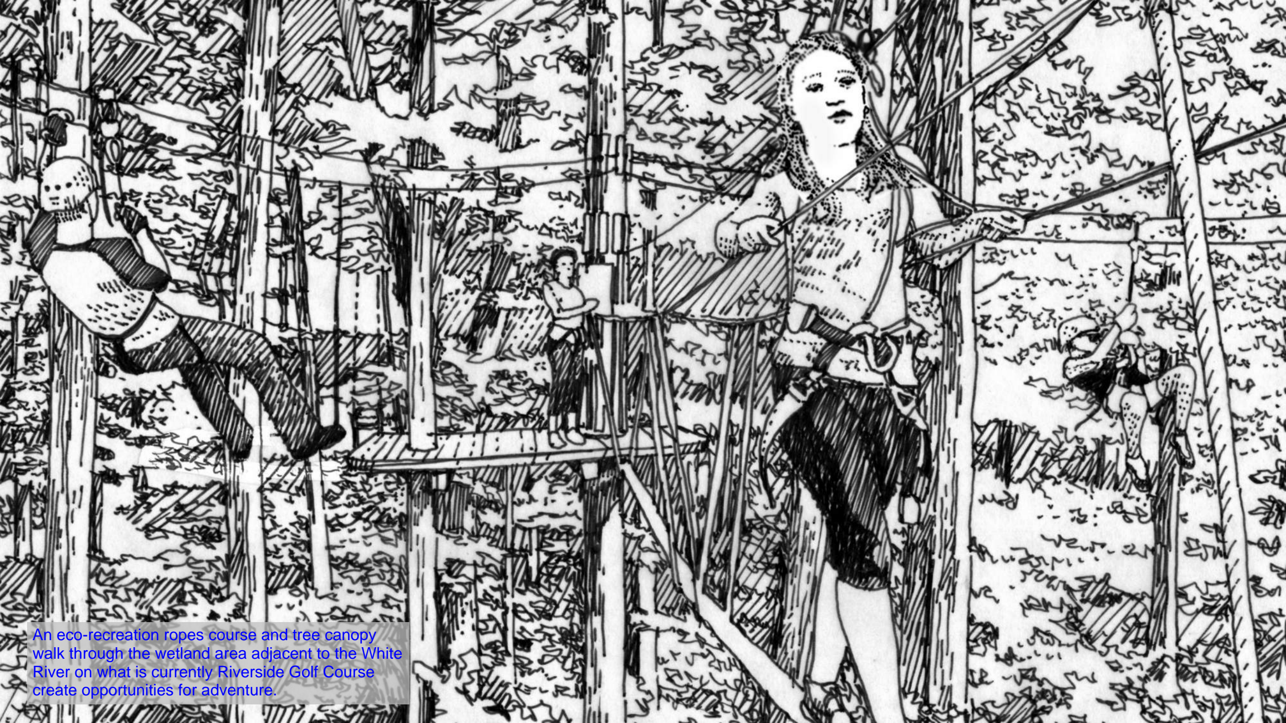
An eco-recreation ropes course and tree canopy walk through the wetland area adjacent to the White River on what is currently Riverside Golf Course create opportunities for adventure.